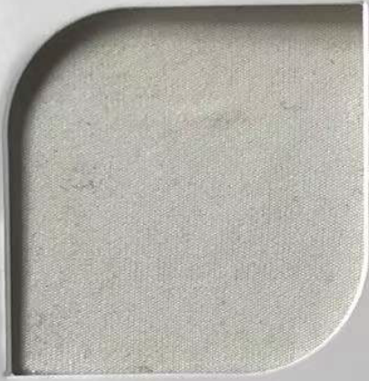
1#本白 off white